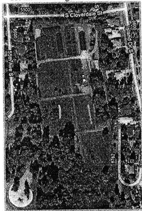
An aerial view of the site, which has green-houses on the north end and acres of open space

process beginning Thursday December 3 rd 7:00 pm